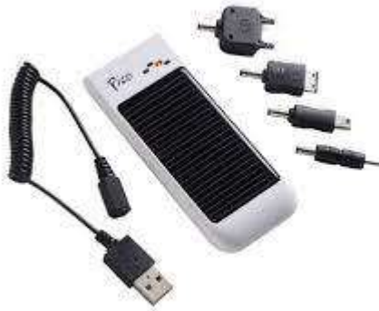
Figure 3: Pico Solar Battery Charger

Solar energy is about reducing our reliance on fossil fuels and Pico solar systems can be used to provide power to a wide range of applications. As their name suggests, Pico solar systems are much smaller than traditional solar home systems generating just a few watts to power light emitting diode (LED) lights and a wide range of energy efficient portable devices.