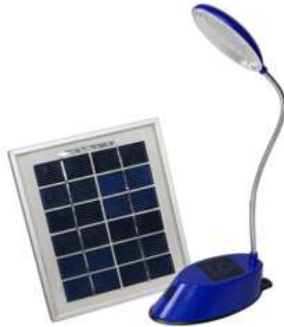
Figure 2: Pico Solar Light

of potential to power low power LED lighting to light up millions of homes in much the same way that cell phones have connected people and communities around the world.